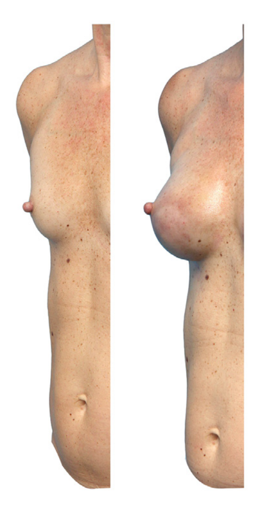
Figure 3: Pre- and post-operation pictures of single-stage direct-to-implant breast reconstruction.

not be calculated, because the data did not capture the possible complication of the 2<sup>nd</sup> operation of two-stage expander-implant breast reconstruction. They also did not mention which types of supportive mesh were included in single-stage breast reconstruction. In this study the early difference was most evident in reconstruction-related implant loss, followed by wound dehiscence at the incision site. Predisposing factor for such early revision rate could be increased breast cup size compared to smaller breast cup sizes, obesity and prolonged operative time. 8,17