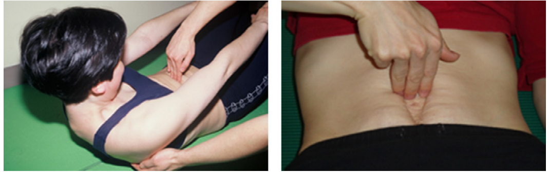
Figure 1: Measurement of diastasis recti abdominis by the finger-width technique

or pillow and bending the trunk to the lower shoulder blades (Figure 1) (3). The diastasis is measured by palpating three points: at the umbilical level, 4.5 cm above the umbilicus and 4.5 cm below the umbilicus (3). DRA was considered present when the separation of the two muscles exceeded two finger widths (5).