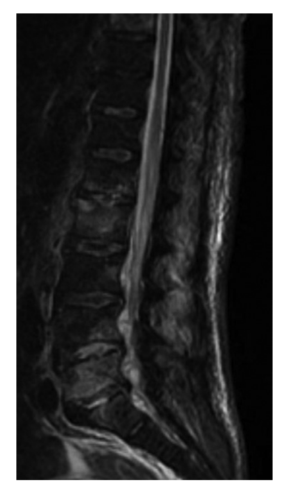
Figure 1: T2 weighted MRI of lumbar spine showing signs of spondylodiscitis from L1 to S1 level.

pain persistence. ESR and CRP values remained elevated (ESR = 95 mm/h; CRP = 186 mg/l). Swelling of his left ankle and right radiocarpal joint appeared; however, both aspirates were negative. S. aureus was cultivated again from his blood cultures. Repetitive contrast-enhanced MRI of the thoracic and lumbar spine revealed no dynamics at T8-T9 level and showed enhanced oedema of the vertebral bodies L2, L4, L5, at L1-L2 and L5-S1 disc levels, and soft tissues (Figure 1). After 3 weeks of medical management the patient was still unable to walk due to sharp back pain which was hard to tolerate despite the use of nar-