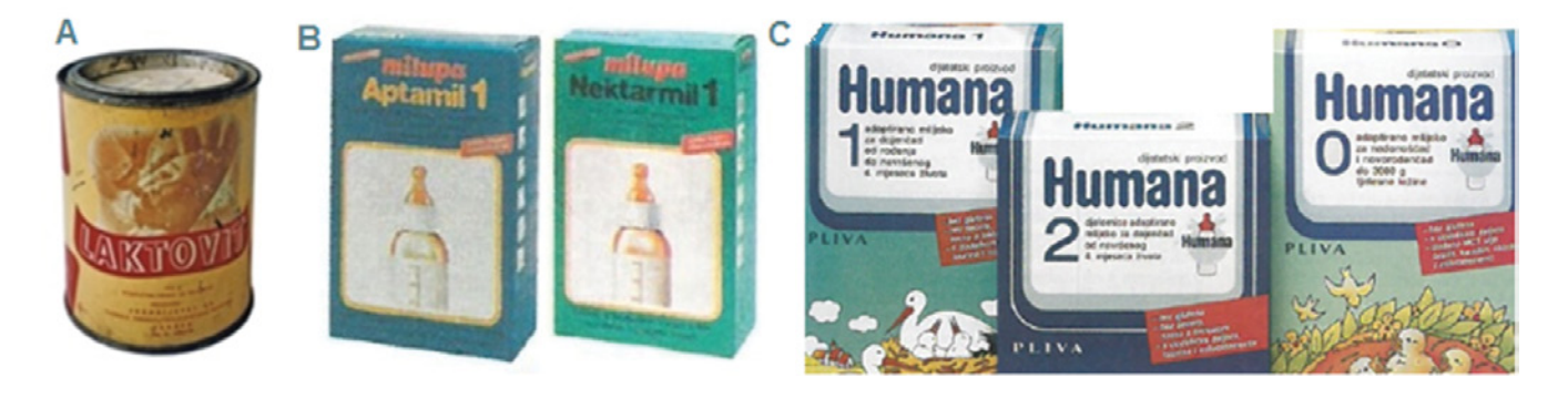
Figure 1: Infant milk formulas available in Yugoslavia in the 1950s were Laktovit (A), Nektarmil and Aptamil (B); Humana was available from the 1960s (C).

to resemble more closely that of human milk (29). We can only imagine how the improvement of infant milk formulas will develop in the future, from genetically engineered infant milk formulas that contain immunity-enhancing antibodies or antigens, formulas that contain cytokines to formulas containing proteins with genetically excluded allergenic epitopes or formulas with tolerogenic peptides (30).