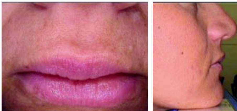
Figure 3. Frontal and lateral digital images of the lips area (explanation in the text).

Sl. 3. Digitalni fotografiji sprednje in stranske strani področja okoli ust (za razlago glej besedilo).